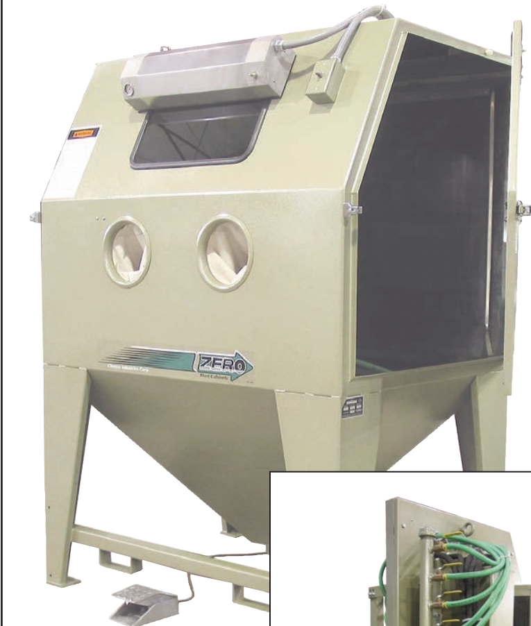
ZERO BNP 220 Cabinet

Applications for the A-300 include cleaning and finishing a variety of automotive parts (from engine valves to caliper cups), peening turbine blades, cleaning small electric motor cores, and etching printer rollers.