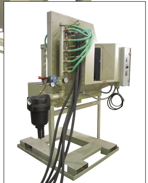
The A-300 Automation Kit replaces the left-hand door on the standard ZERO BNP 220 blast cabinet.

With optional special fixtures and masking, an A-300 automation kit lets you thoroughly etch handgun parts prior to plating, selectively etch logos and lettering into glass bottles, even deburr and finish plastic tool bodies.