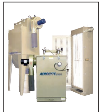
Aerolyte's efficient Dust Collectors

For stripping small components quickly and easily. Available in several sizes, Aerolyte cabinets include the enclosure, pressure blast machine and a choice of dust collectors.