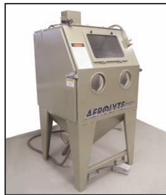
Aerolyte 3636A Dry Strip Cabinet

The Super Comet is ideal for selective stripping jobs where containing the stripping media is desired, keeping the workplace clean.